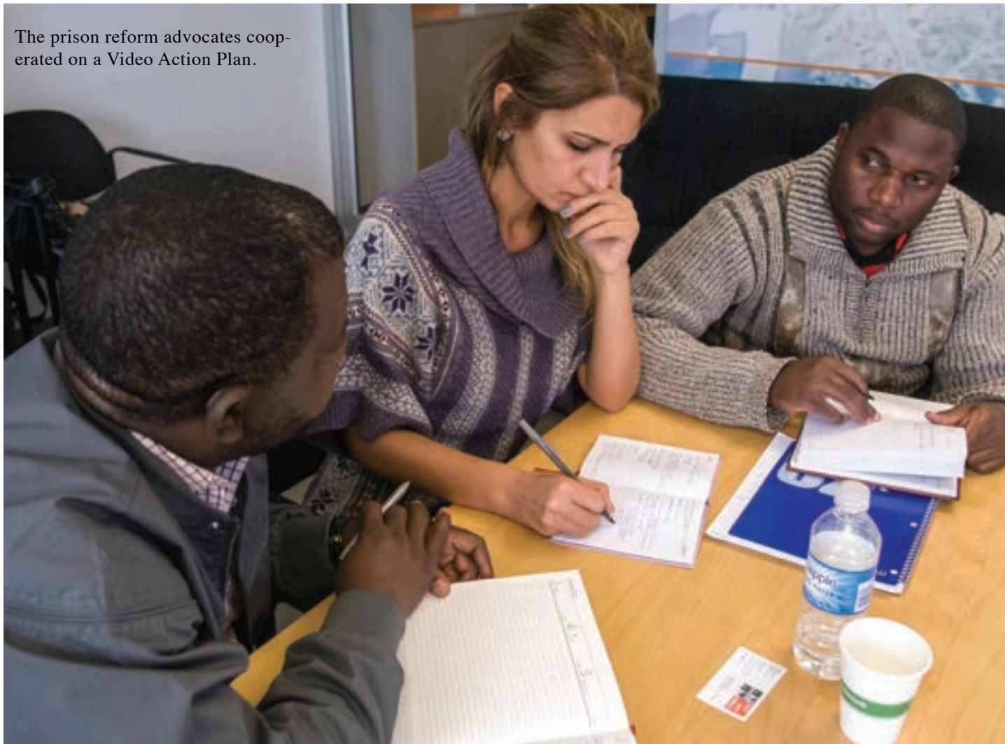
The prison reform advocates cooperated on a Video Action Plan.