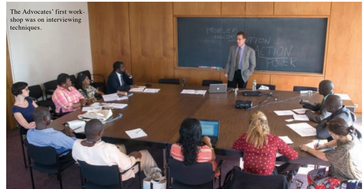
The Advocates’ first workshop was on interviewing techniques.

The 2013 HRAP marked the program’s 25th class. Through academic coursework, skills-building workshops and networking opportunities with the human rights, academic and donor communities in NYC and D.C., HRAP has strengthened the skills,